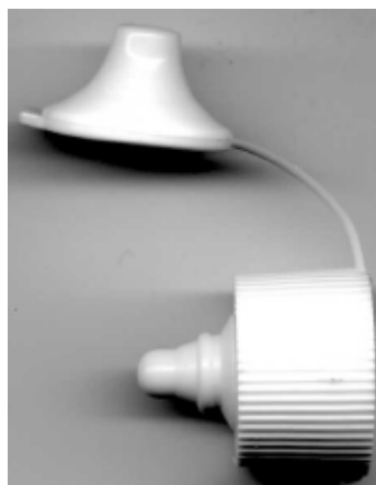
Fig.2. A standard FAITH™ 30ml HDPE dropper cap