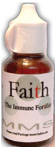
Fig.1. A standard FAITH™ 30ml HDPE bottle with dropper cap

The 30ml bottle holds approximately 450 drops. One milliliter (or one CC) is equal to approximately 15 drops.